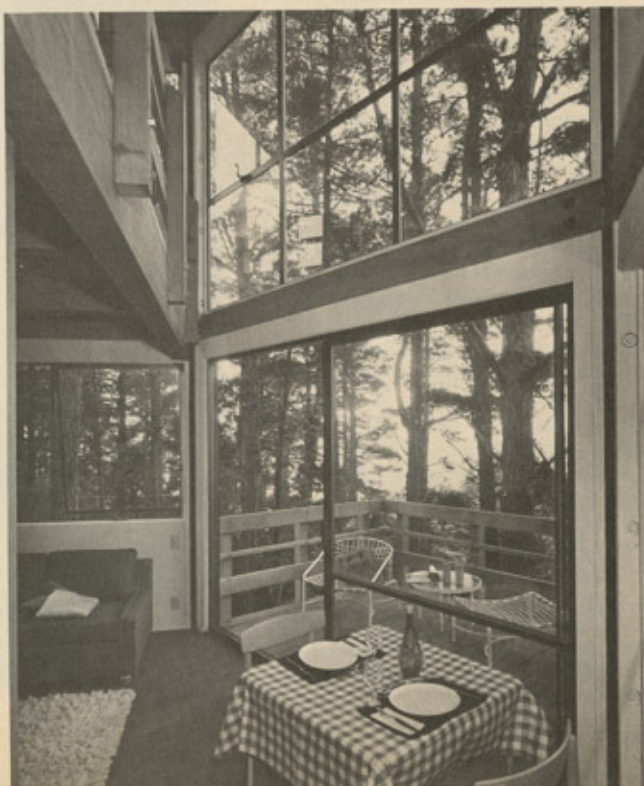
A sleeping deck overlooks the two-story living room in this vertically-organized octagonal house for a steep, wooded site.